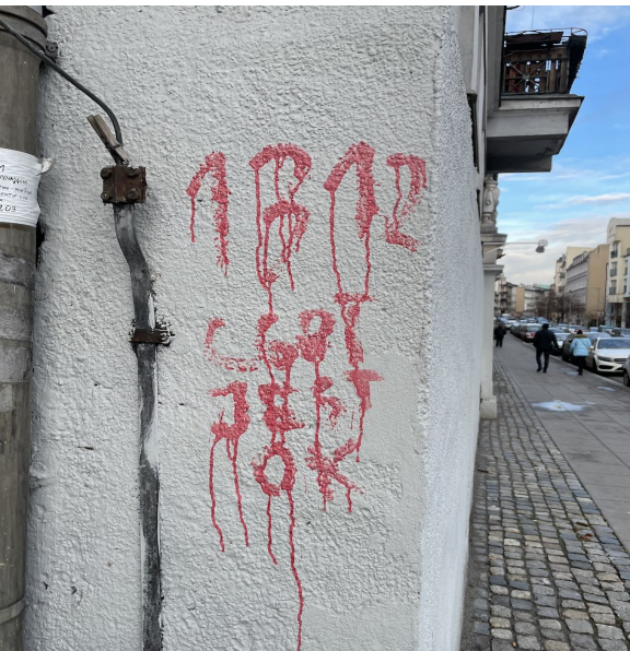
“1312 LGBT JEST OK” “1312 (ACAB) LGBT IS OK”