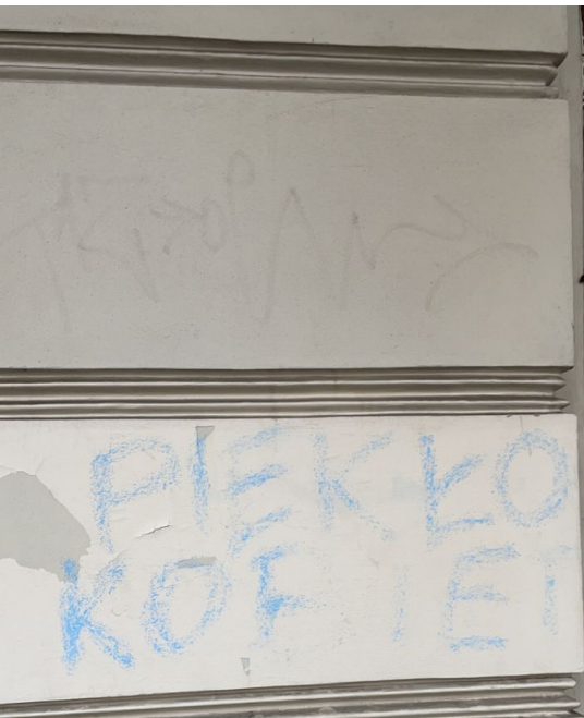
“PIEKLO KOBIEI” “WOMEN’S HELL”