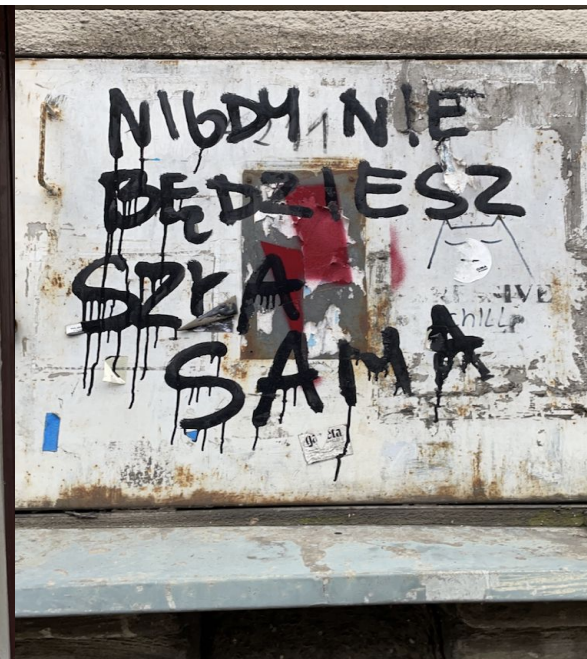
“Nigdt nie bedziesz szla sama” “You’ll never walk alone (f)”