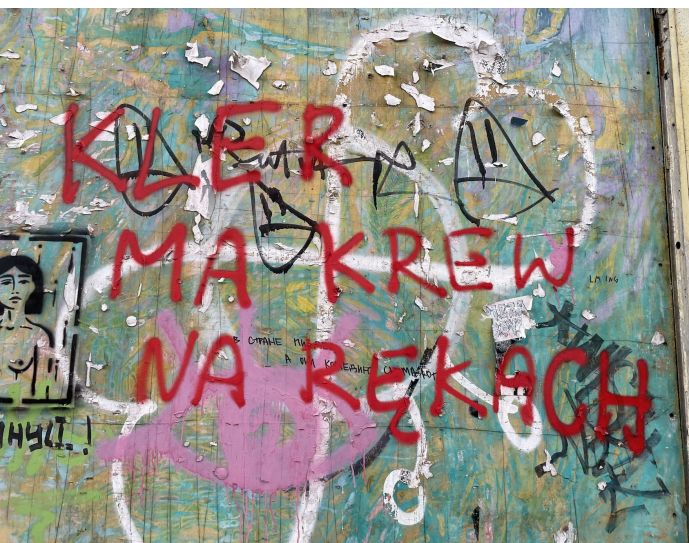
“KLER MA KREW NA REKACH” “THE CLERGY HAS BLOOD ON ITS HANDS”