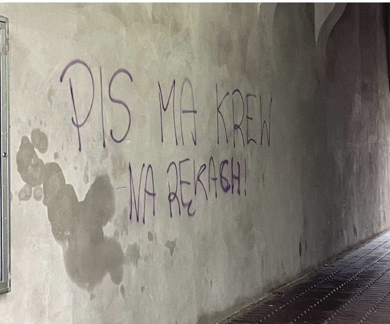
“PIS MA KREW NA REKACH” “PIS HAS BLOOD ON THEIR HANDS”