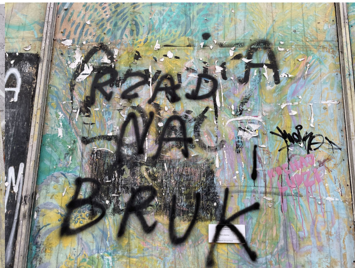
“RZAD NA BRUK” “DUMP THE GOV”