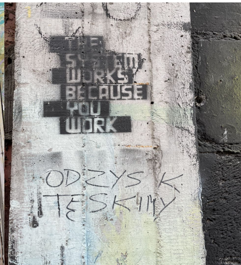
“THE SYSTEM WORKS BECAUSE YOU WORK